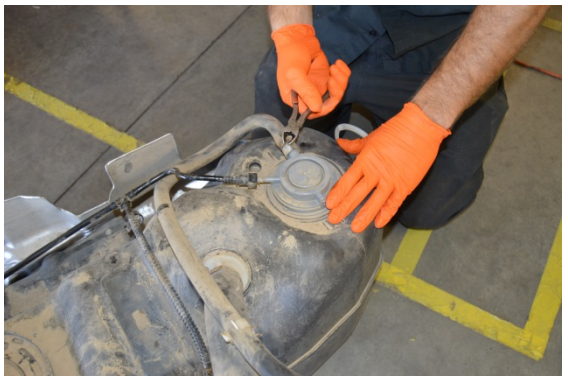
(Fig. 4) Using a pair of dikes, cut off the clamp holding the factory vent line. Remove the line, and the fill hose and install them both on the new TITAN tank.