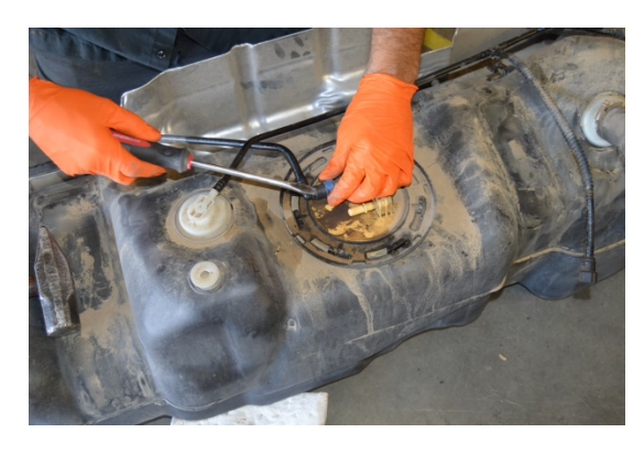
tank by turning counter-clockwise.