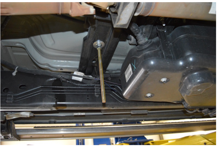
(Fig. 6) Install the "Threaded Rod" from the "Front Support Assembly" in the cross member just behind the DEF tank.