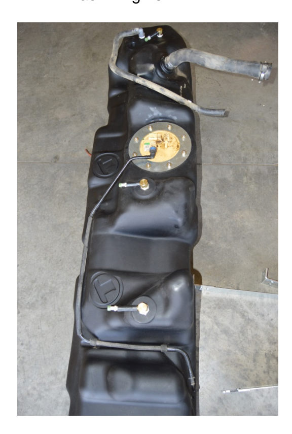
(Fig. 5) Install the hoses from the OEM tank on the new TITAN as shown above.