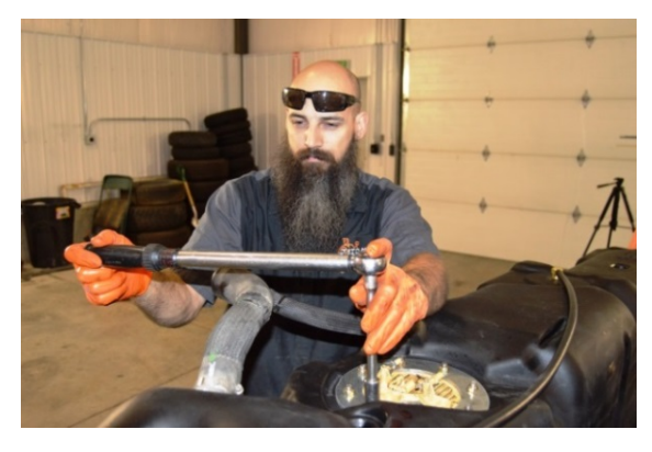
(Fig. 3) After placing the sending unit into the TITAN tank, install the top flange, and tighten the nylon lock nuts to 20 lb. ft. using a "start" pattern using a torque wrench.