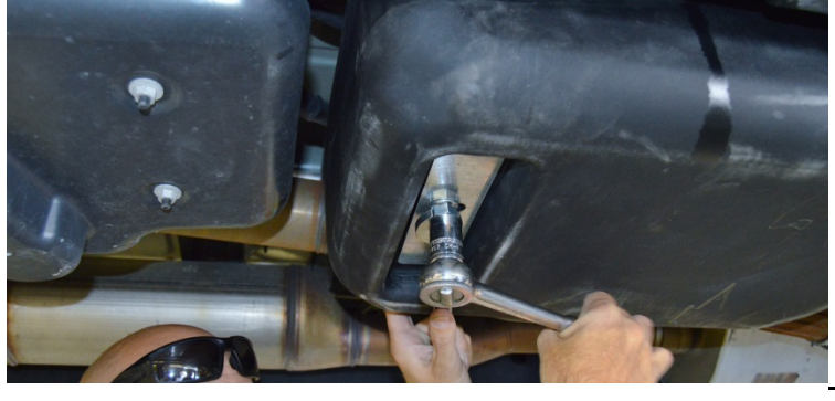
(Fig .8) Tighten the "Front Support Assembly" to specifications.